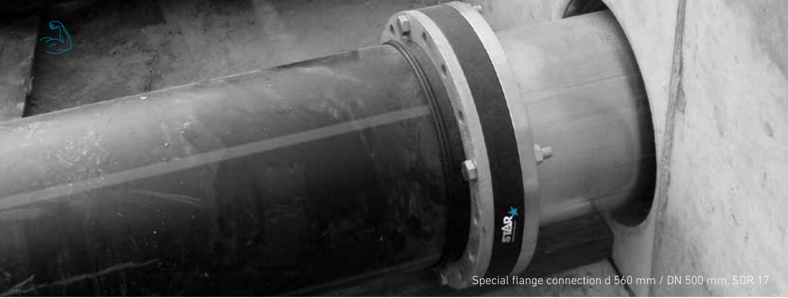
Special flange connection d 560 mm / DN 500 mm, SDR 17